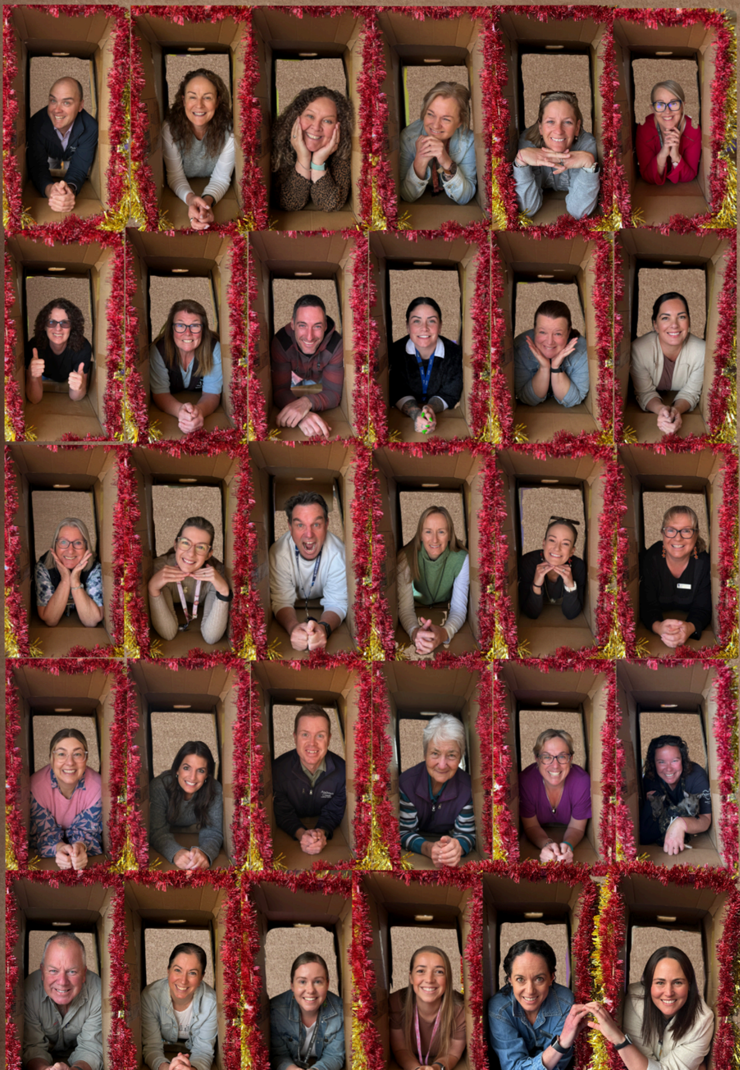
From our Creek Family to your Creek Family, Merry Christmas!