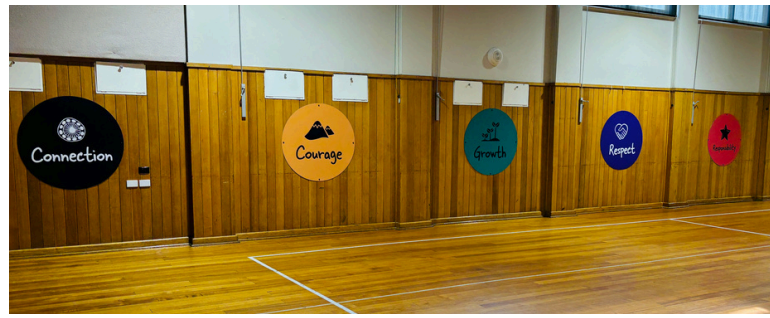
In our hall