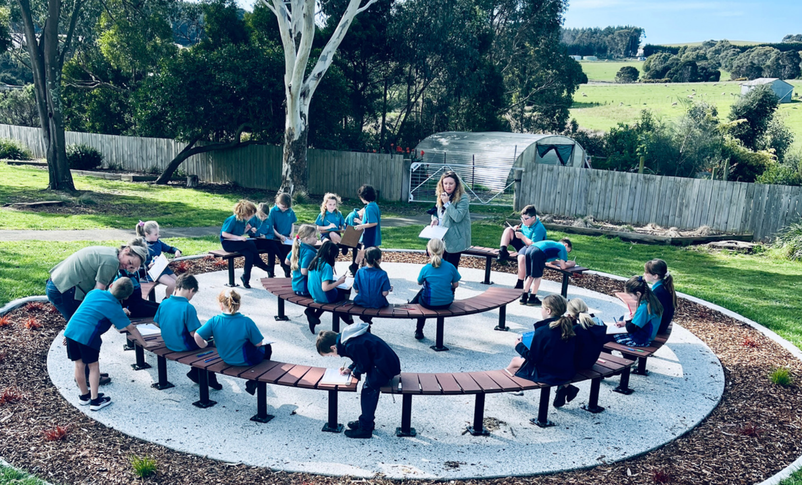
Our 1/2 class making the most of this spring weather in our wonderful outdoor classroom space this week.