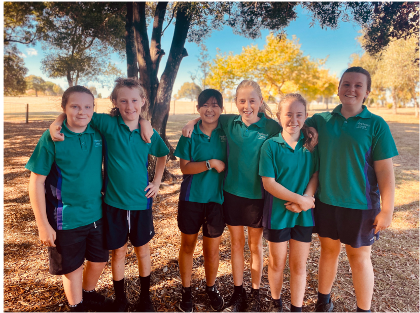
Above Photo: Library Monitors