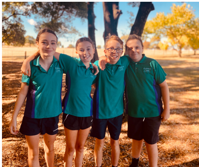
Above Photo: Franklin House Captains