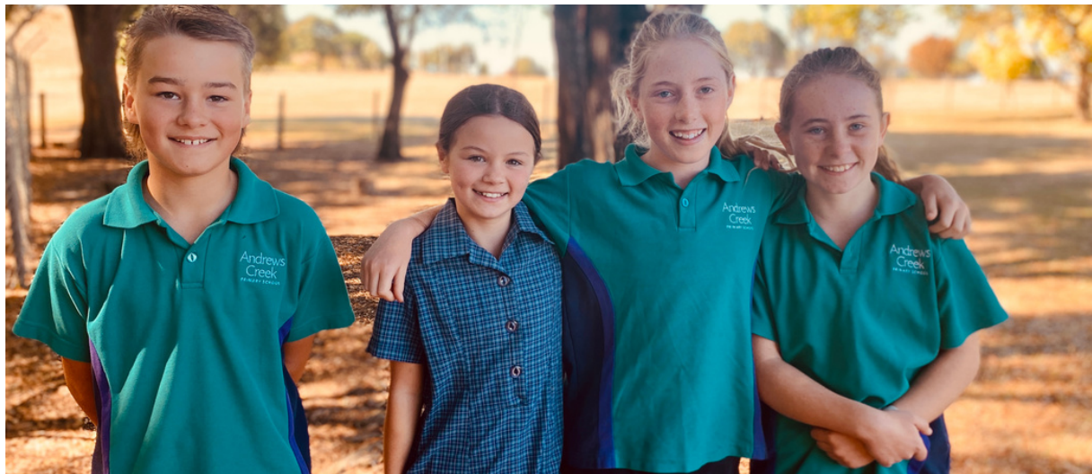
Above Photo: Rubicon House Captains